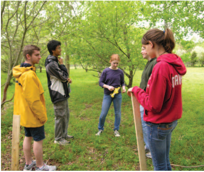
SEQ students placing markers for proposed path at Edgar Avenue