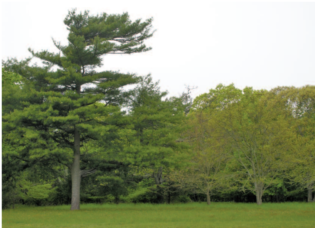
Above is pictured an Eastern white pine, one of many beautiful trees on the Marist property. It is anticipated that there will be trails on the property open to the public.