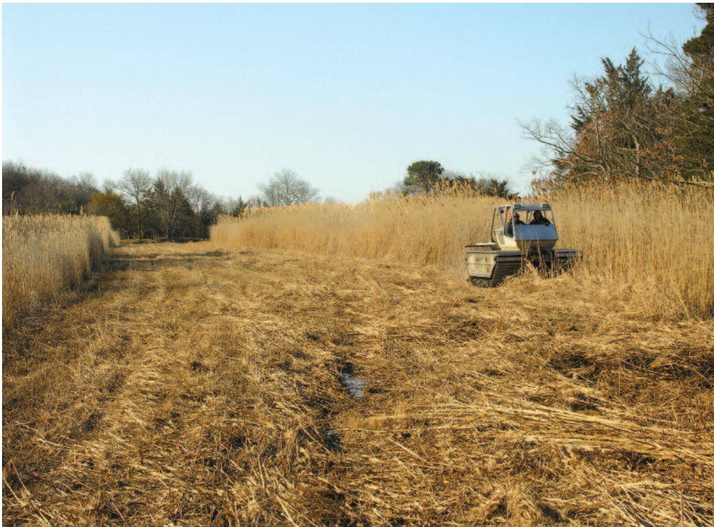
“Marsh Master II” mowing Phragmites along Beaver Dam Creek

The Foundation hopes to develop some walking trails along the bank of the Creek which has been opened up through this mitigation project.