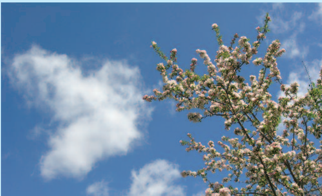
Spring in Brookhaven

We have included an envelope for your convenience or you can go to our website, www.postmorrow.org and contribute via the “donate now” pay-pal button.