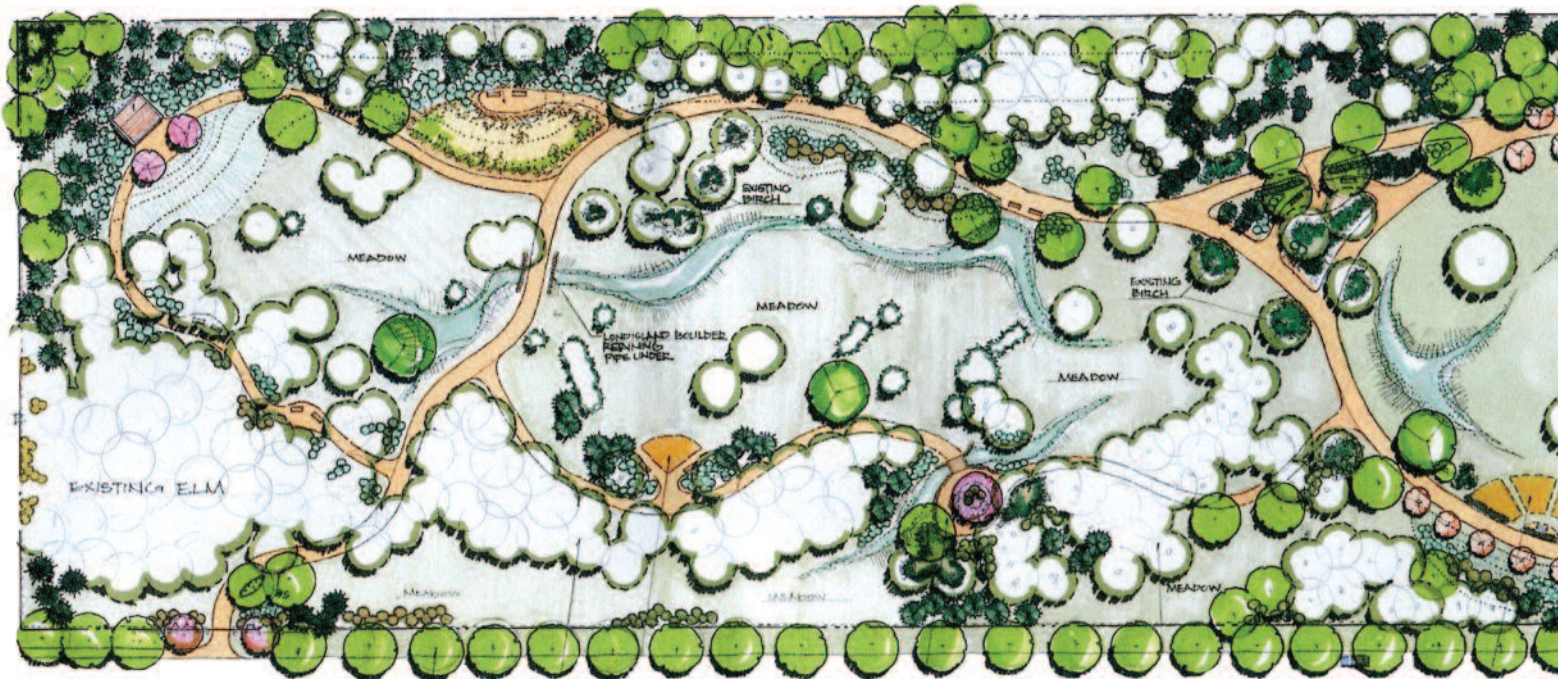
Concept Plan for Edgar Avenue property