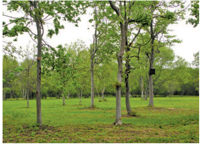
Edgar Avenue south of Jared's Path

The Foundation held a community meeting last year to present proposed plans for our nine acre property along Edgar Avenue. After incorporating this feedback into an updated plan, the Foundation has removed the invasive Wisteria vines and re-seeded the property to create more open spaces. Currently we are developing a trail system around the property with the