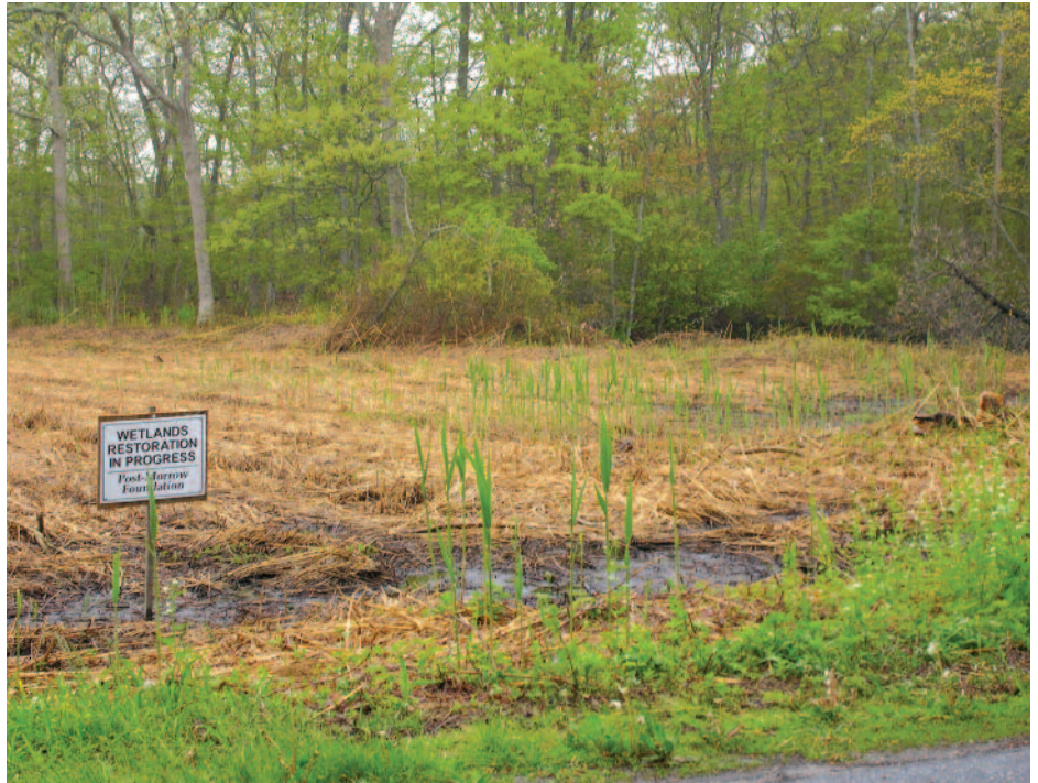
Wetland area along Bay Road. The sign indicates that the area is part of the Post-Morrow wetland restoration project. To the right is “Black’s Pond”.

The current restoration involves Post-Morrow property further north on the east side of the Creek. About ten acres of tidal wetlands has been treated by spraying an herbicide called “Aquamaster”, an EPA approved product for this purpose. The treated wetlands have been subsequently mowed by Innovative Mosquito Management, Inc. from Madison Connecticut, with the “Marsh Master II” fitted with a brush hog mower deck. The Foundation has worked closely with