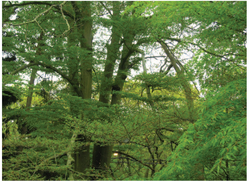
A grand old Silver Beech on the property