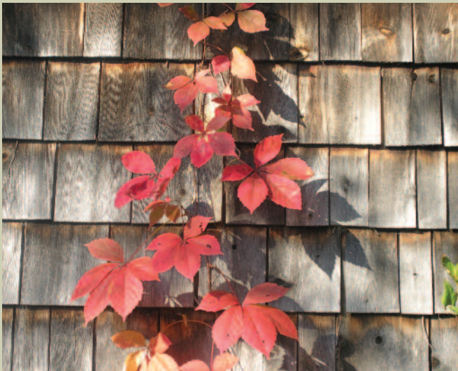
Virginia Creeper, Parthenocissus quinquefolia

We have included an envelope for your convenience or you can go to our website, www.postmorrow.org and contribute via the “donate now” pay-pal button.