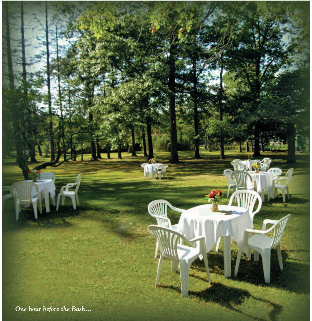
One hour before the Bash...

We truly appreciate all the friends and supporters who turned out for the Boardwalk Bash held at the Post-Morrow Foundation on September 20th. The Foundation will use the funds raised to help build a boardwalk along the east side of Beaver Dam Creek to join the woodland trail which begins at the Foundation headquarters at 16 Bay Road.