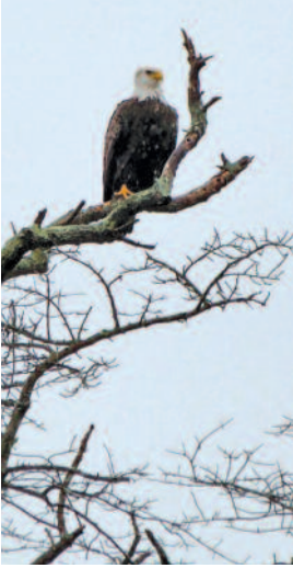
Bald Eagle on Beaver Dam Creek –, October 2014

NONPROFIT ORG U.S. POSTAGE PAID Permit No. 15 Brookhaven, NY 11719