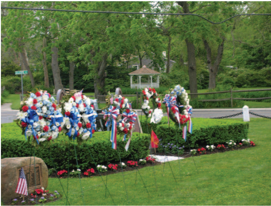
Brookhaven Hamlet Memorial Park, beautifully maintained by the Brookhaven Fire Department