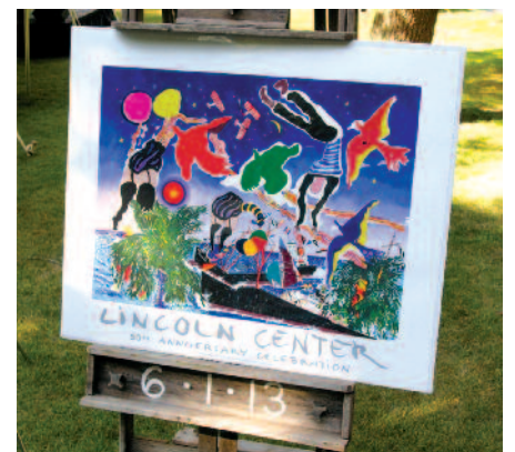
50th Anniversary of Lincoln Center donated by Malcolm Morley

Here are three of the many original works of art donated to the Boardwalk Bash. The Foundation thanks the many people who donated items for the live and silent auctions.