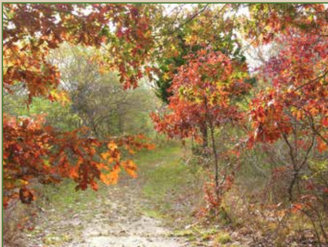
Post Morrow Trail

We have included an envelope for your convenience or you can go to our website, www.postmorrow.org and contribute via the “donate now” pay-pal button.