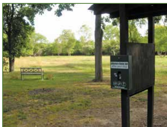
Dog waste station at Edgar Avenue

According to the Town of Brookhaven code; Chapter 23, Dog Control and Animal Welfare , people are held responsible for picking up their dog's waste in a sanitary manner, sealing it and depositing in a garbage receptacle. It should never be thrown in sewers or drains. Additionally, according to Town code, unless on owners' property, or with a permitted hunter, no dog may run free on public streets, parkland or private property without the owner's consent.