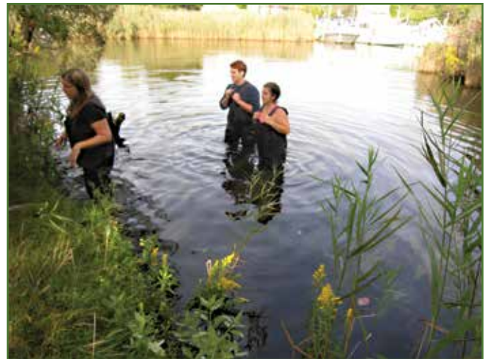
Students from Bellport High School participated in A Day in The Life event on Beaver Dam Creek at the Post-Morrow Foundation

A Day in the Life of the Carmans River , an event that has expanded to include the Peconic Estuary and Nissequogue River (and Beaver Dam Creek as well as other estuaries along the shores of Long Island). This event is designed to celebrate the river and estuary ecosystems and educate participants on the uniqueness of Long Island’s NY State-designated Wild and Scenic rivers. On Friday, September 25th, environmental education partners and students all along the river simultaneously collected scientific information, analyzed it and shared it to portray the status of the river and estuary ecosystem. Students used hands-on field techniques to describe their sites, catch fish in nets, collect water and invertebrate samples, develop a biodiversity inventory of the riparian zone and analyze water chemistry. Students examined the physical and chemical aspects of the river, such as where freshwater and salty seawater meet, the amount of sediments in the water and turbidity and oxygen levels, as well as conducted biodiversity inventories of the flora and fauna in and around the ecosystems.