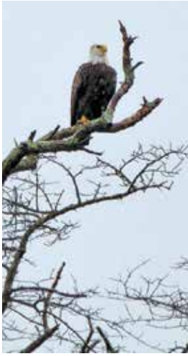
Bald Eagle on Beaver Dam Creek

NONPROFIT ORG U.S. POSTAGE PAID Permit No. 15 Brookhaven, NY 11719