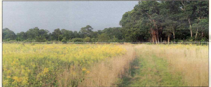
A view of Long Meadow Farm looking east along the farm road. The Goldenrod provides a beautiful sea of golden open meadow.