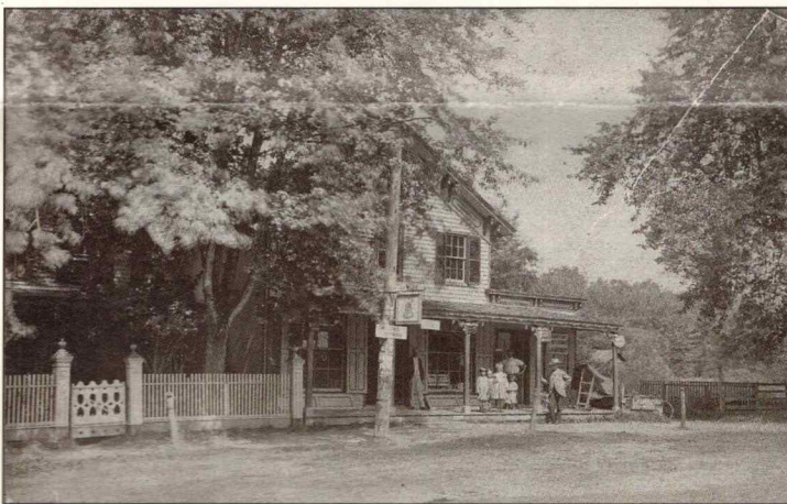
This photo shows the Brook Store as it was around 1907 before it was moved from across the road to its present location. Shown in the picture are Forrest Reeve, the postmaster, and several members of the Nelson family.

pleasure boats, and a place to watch the marshlife. Just beside Squassux is a boatworks which conveys the sense of another century, while from its rickety docks one sees out across water and grass as it must have looked to Indians.