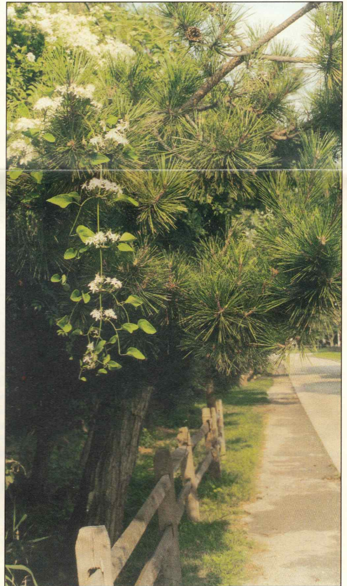
Wild Clematis and Pitch Pine along historic Beaver Dam Road which was first laid out in 1735

It is because our hamlet is one of the few surviving instances of an endangered species that its members are requesting it be recognized as meriting the protective status of an historical district. It is not the desire of the residents of Brookhaven Hamlet to stop time or to turn the clock back. But we recognize that the luck that has enabled the hamlet to survive cannot be counted on to last, and the community must take some responsibility for its maintenance, to have some measure of control over the future, so the natural sort of growth and change which have brought about its cherished atmosphere may continue.