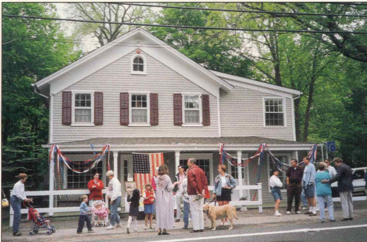
This photo shows the Brook Store on Memorial Day, 1998 after the renovations were completed. The Foundation served lemonade to marchers and spectators who attended the traditional Memorial Day parade and service in Memorial Park in Brookhaven.