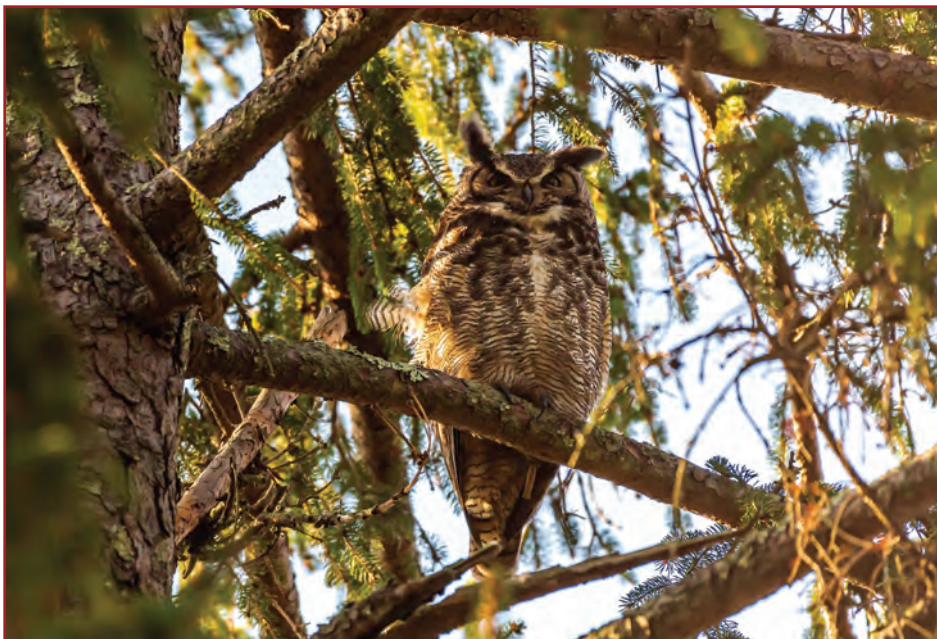
Great Horned Owl watching from her perch at Post-Morrow

“With its long, earlike tufts, intimidating yellow-eyed stare, and deep hooting voice, the Great Horned Owl is the quintessential owl of storybooks. This powerful predator can take down birds and mammals even larger than itself, but it also dines on daintier fare such as tiny scorpions, mice, and frogs. It’s one of the most common owls in North America, equally at home in deserts, wetlands, forests, grasslands, backyards, cities, and almost any other semi-open habitat between the Arctic and the tropics.