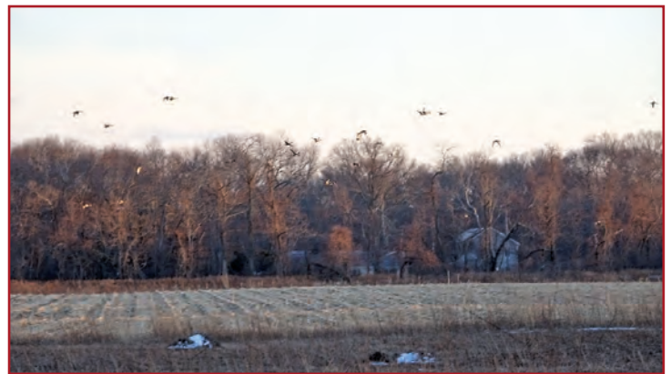
Mallards coming into cut corn February 2019.

Unfortunately, that did not come to pass, as in year two, Spring of 2019, the crop was planted too late in June and the green shoots were completely decimated by the deer population to the point where there was not a single mature corn plant. Well, we had that all figured out and ready to plant corn by May 15 in Spring of 2020 and then COVID-19 hit. This may sound odd, but we all know that it has taken a toll in many ways. For us it involved the uncertainty of whether Grad Students would be allowed to come to LI, the difficulty of dealing with the various County personnel who were not working full-time and quite frankly a decrease in available revenue for the LIWHG as a whole. Hopefully, we will be back with a corn crop in May of 2021. I look forward to keeping you informed.