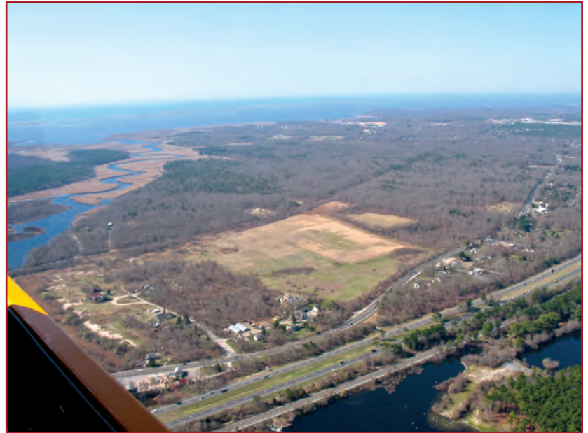
Robinson Duck Farm County Park